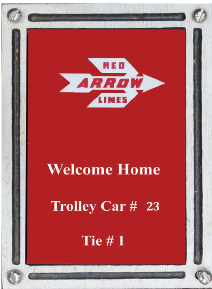
Actual size is 4X6"